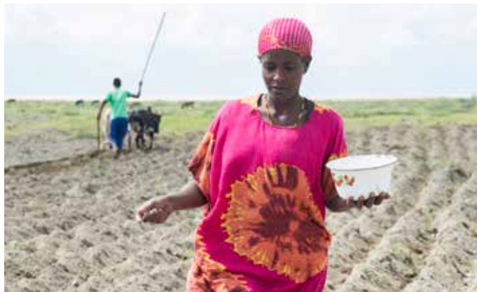
A farmer sows maize seeds in Hurufa Lole kebele.

The activity organizes community members, mostly farmers, into groups where they are trained in the CRS Saving and Internal Lending Communities, or SILC, methodology. They are also trained in employment skills and other off-farm activities as a way to diversify their livelihoods. Livelihood group members are provided with climate-smart agricultural inputs and linked to agro-dealers and marketing agents.