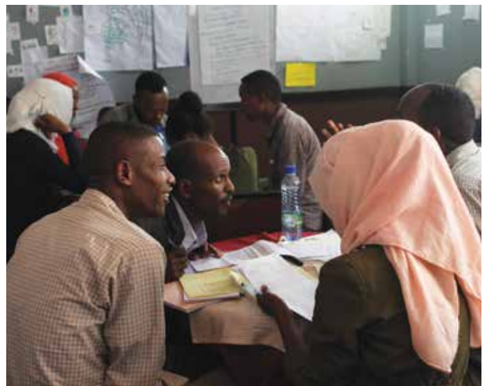
Participants are trained in monitoring and evaluation.

Interactive voice response (IVR) pilot: In cooperation with Humanitarian Network International, the DFSA piloted a participant feedback-handling mechanism called interactive voice response. The mechanism is an automated, toll-free hotline that allows clients to provide feedback through a voice-assisted menu in their respective local languages. Pilot feedback showed that the number being used for the hotline was too long for people to memorize and the script longer than necessary. DFSA shortened the script and refined the feedback-handling process. Discussions are underway to ensure consistent messaging.