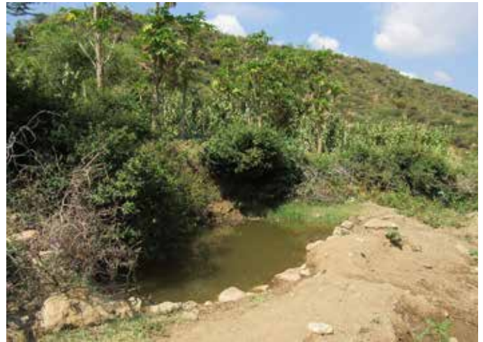
The dam (above) enables increased groundwater discharge (above right) even when the river runs dry.

Like much of rural Ethiopia, the residents of Kurtu kebele in Dire Dawa experience low agricultural productivity, soil erosion and water shortages. The DFSA aims to support the construction and rehabilitation of structures to strengthen community watersheds, and promote water and soil conservation practices that farmers can use to increase productivity.