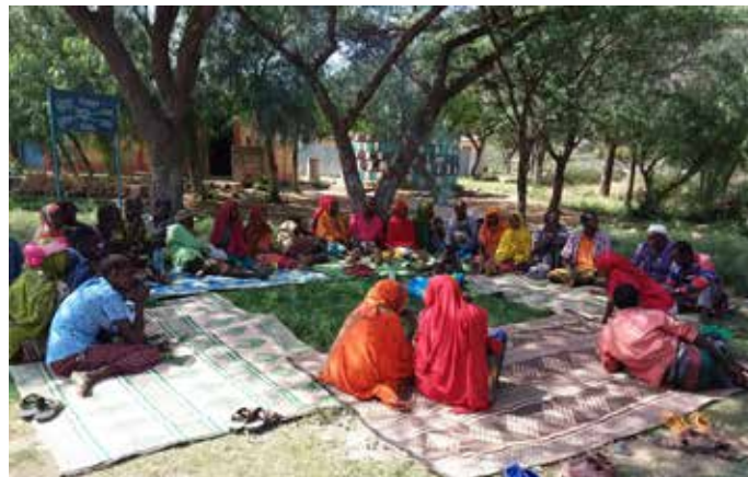
Community conversations bring people together for discussion of key issues in a safe and welcoming environment.