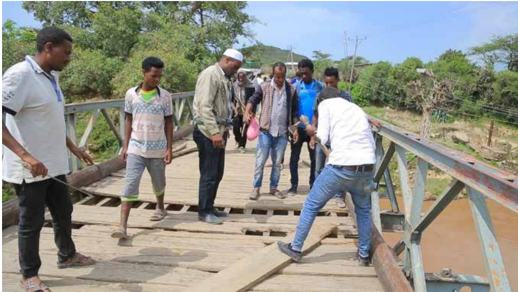
Youth volunteers rebuilt a bridge that is vital part of community infrastructure.

In Ziway Dugda woreda , river bank erosion caused by flooding threatened to destroy a bridge connecting communities on either side of the river. Thousands of people would have been cut off from markets, cities and main roads, and unable to maintain their way of life. As part of the DFSA, youth in Ziway Dugda were able to save the bridge and became role models for other community members.