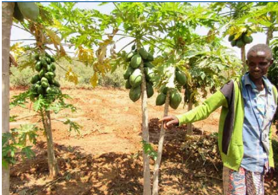
Umer Mohamed, a model farmer, explains how he taught others to adopt agroforestry practices using his farm as an example. Farms are fed by water captured from a community-constructed sediment storage dam. Read more on Page 3.

The CRS Development Food Security Activity is running from September 30, 2016, through September 29, 2021, and has three purposes—PSNP systems strengthening, economic livelihoods, and maternal and child health and nutrition, including water, sanitation and hygiene—with gender and youth as a cross-cutting purpose; as outlined below: