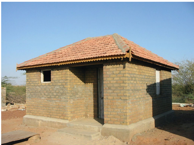
Completed disaster resilient hollow Interlocking Compressed Stabilized Earth Block homes.