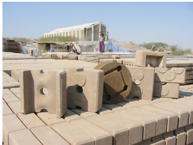
Various types and shapes of hollow interlocking CSEB block produced for construction.