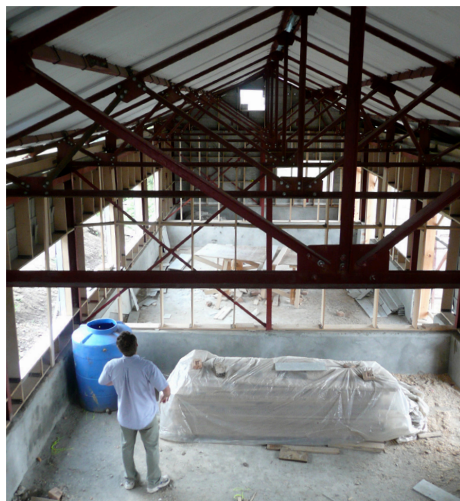
CRS engineers worked with local residents to put together the steel skeleton of a CRS-built community school in an earthquake-affected village