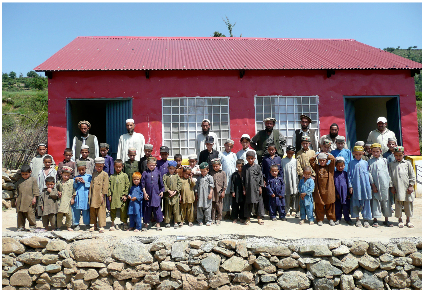
Students, teachers and PTC members outside newly completed primary school in Bar Gabar Village.