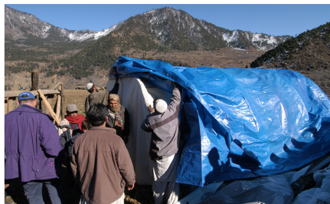
The tunnel winterized emergency shelter was constructed out of large plastic sheeting stretched over arched plastic tubing, with inside cloth lining. They are flexible in design, allowing for larger shelter sizes than tents; they are easy to build (set up takes about two hours); and they are made from materials that can be obtained locally