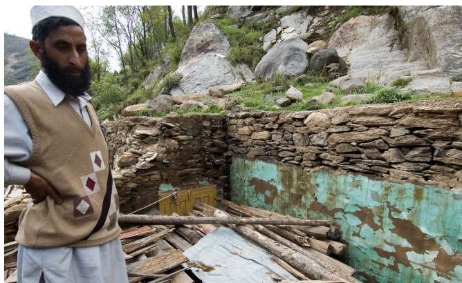
Over 500,000 homes were destroyed by the earthquake.

On October 5, 2005, a massive earthquake rating 7.6 on the Richter scale shook large areas of northern Pakistan, causing widespread destruction, killing over 73,000 people, severely injuring many more and leaving millions without homes. The Northwest Frontier Province (NWFP) and Azad Jammu and Kashmir (AJK) suffered extensive structural and economic damage, with vulnerable groups in this mountainous region bearing the brunt of the disaster. Most educational institutions were destroyed, the majority of health care units and hospitals collapsed, the communications infrastructure was severed, and all essential utilities were disrupted. In all, the affected area was strewn with 200 million tons of debris. Hundreds of post-quake tremors and constant landslides multiplied the shock and trauma, while the onset of winter threatened. The international humanitarian community faced an unprecedented challenge in responding to the housing needs. The scale of the task was huge, with half a million homes damaged or destroyed. With winter approaching, aid had to be delivered quickly, and in difficult, mountainous conditions.