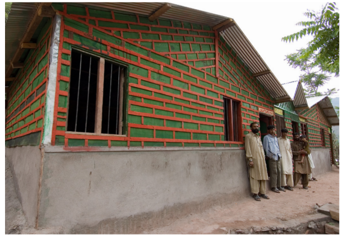
Salvaged timber used for functional and decoration uses on winterised transitional shelters.

A diagram showing the responsibility on CRS, Community and the household.