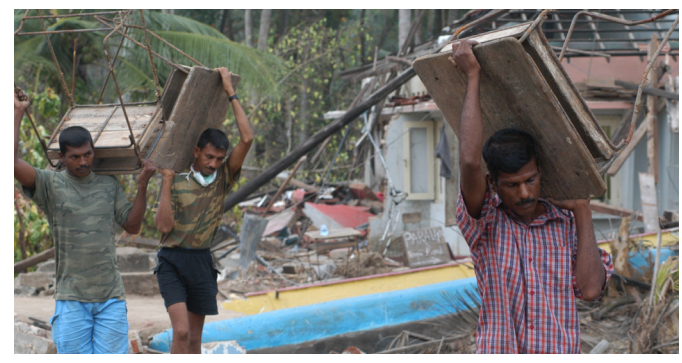
The tsunami created widespread destruction in Sri Lanka those people were able to salvage some materials in order to begin the slow rebuilding process.