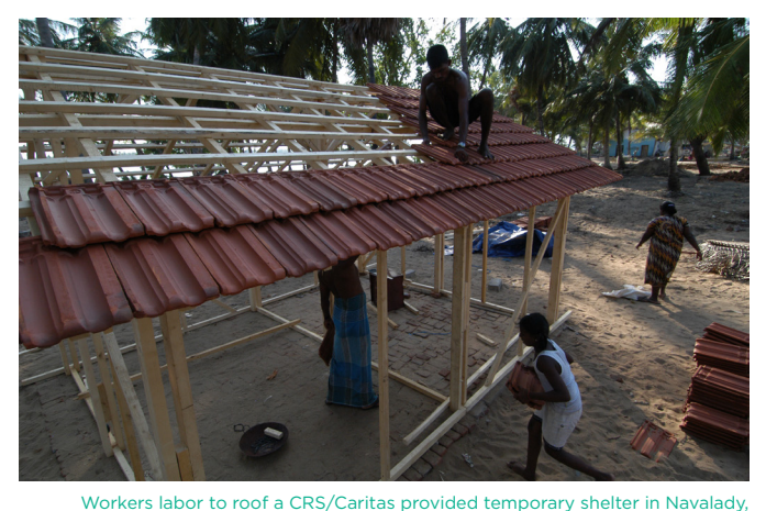
Workers labor to roof a CRS/Caritas provided temporary snelter in Navalady, one of 86 such homes provided by CRS/Caritas in the community, which was nearly wiped out by the tsunami. In all, the roof consists of 400 clay tiles, each costing about .14 cents, which help to keep the insides of the homes cool in temperatures exceeding 100°F (38°C) in the hot months.