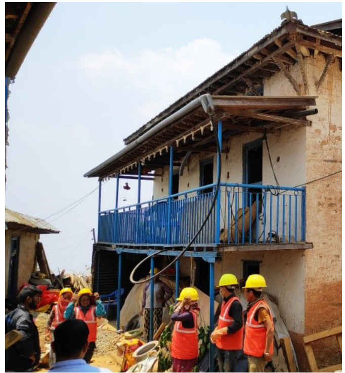
Ward No. 5, Temal Rural Municipality, Kavrepalanchok: Demo retrofit house carried out as part of the DFID funded retrofit project implemented by a consortium of UNOPS, Build Change, and BBC Media Action. Two male and three female masons are being trained under two head masons and an engineer.