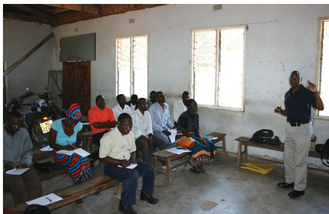
CRS created model homes built according to traditional designs. Additionally, CRS/partner provided materials and cash-for-work grants for the 10% most vulnerable families.