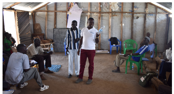
Water User Committee training session.

Comprehensive Refugee Response Framework video in Uganda - CRS