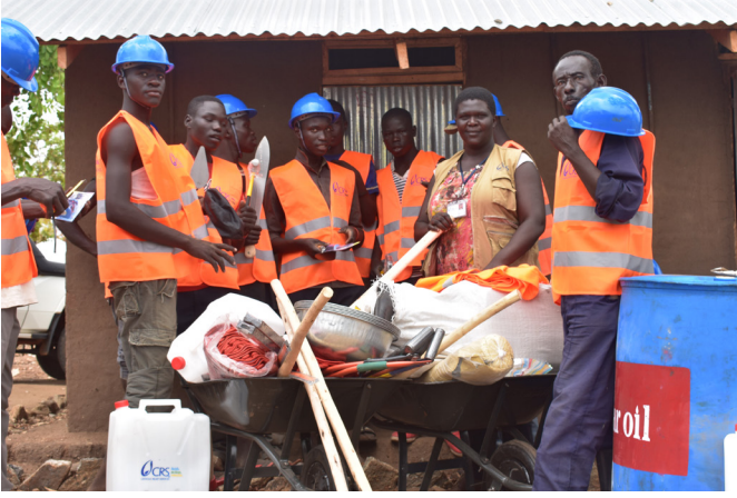
A community group receives their latrine digging kit.