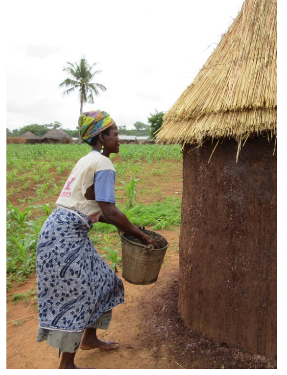
SILC member accessed loan to construct household latrine in Tichiritaaba -East Mamprusi District, Northern Region