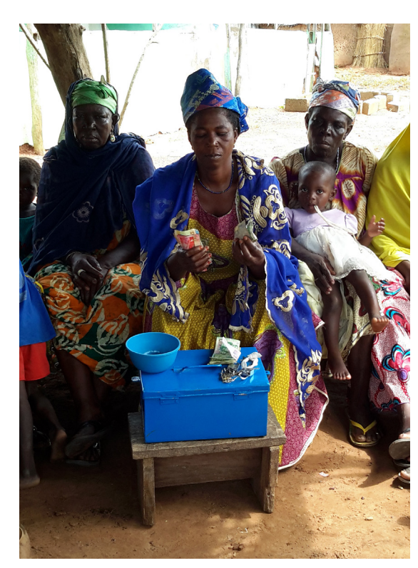
SILC group meeting in Gbangu community-Northern Region

an environment free of open defecation, as well as a quality learning environment to enhance knowledge retention by students in school.