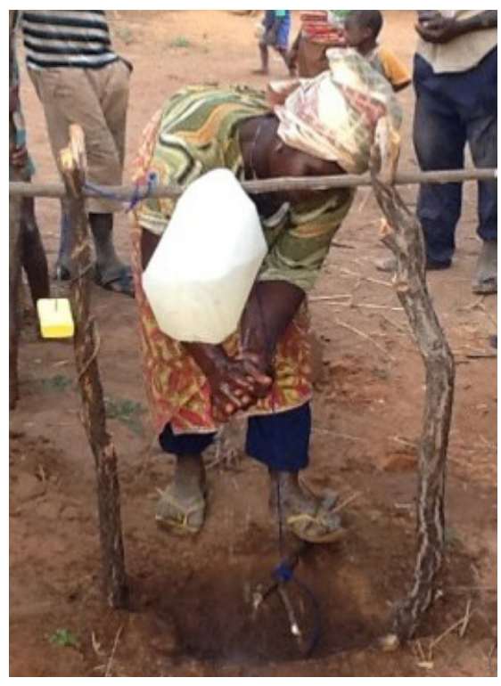
Photograph 4. SILC household empowered to construct hand washing device-Talensi District

The SILC methodology has facilitated greater social cohesion among members and helped vulnerable women to resolve their economic and social issues. It has further led to increased financial inclusion through an enhanced market-based strategy led by Private Service Providers, whose provision of services in exchange for fees increases the SILC model's sustainability. SILC offers an ideal platform for integration of WASH initiatives by enabling communities to mobilize funds and access loans to construct household latrines, and repair boreholes to ensure continuous access to safe water. In addition to providing opportunities for savings and investments in WASH services, the SILC groups are used to disseminate sanitation and hygiene behavior change messages.