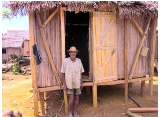
House under construction (top) and completed (bottom). The project used remote management through community committees to build 598 houses in difficult to access villages and conduct trainings.