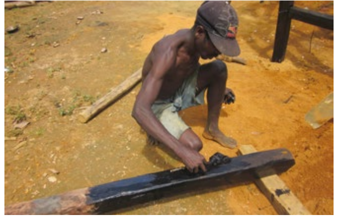
Structural members are treated with used engine oil, or similar to preserve and to prevent termite infestation.