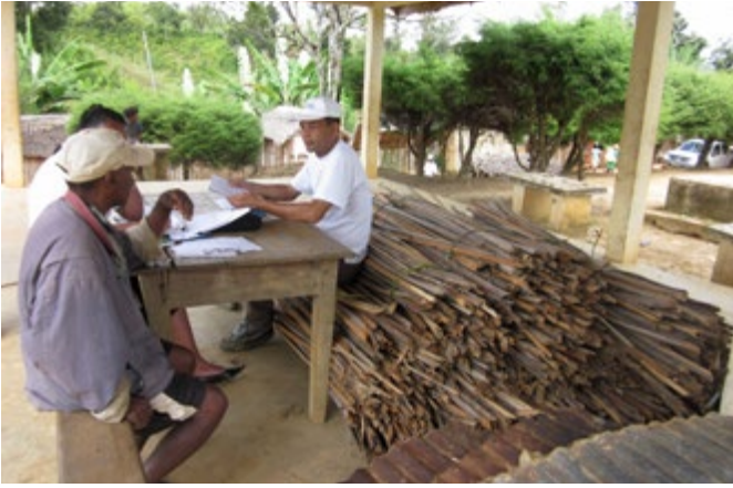
CRS staff running a material distribution point in the centre of the village.