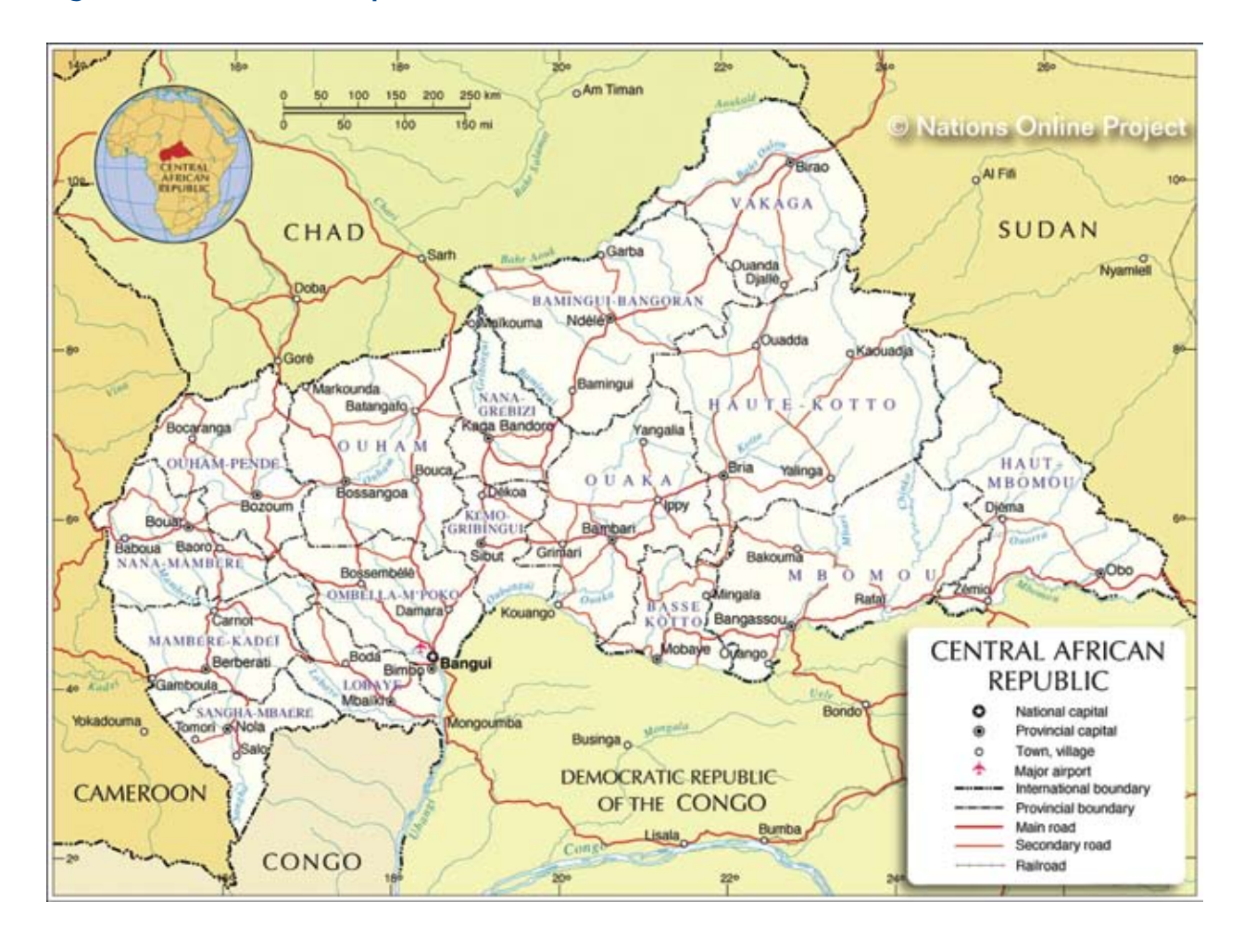
Figure 1. Central African Republic