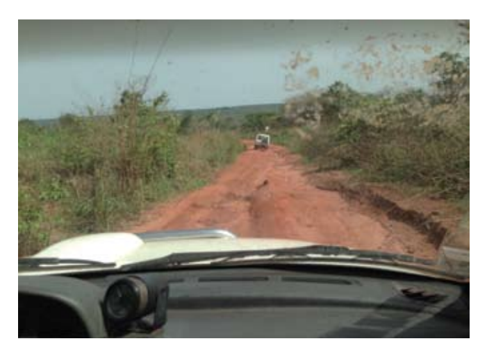
Road between Boda and Ngotto.

return much harder. Some 32,559 people remain displaced, either in the forests surrounding Boda or in displacement camps where housing units are sometimes insufficient to meet the needs of the entire family unit.<sup>230</sup> In other locations, communal structures like mosques were targeted, and their continued state of disrepair can discourage communities from returning, as has happened in Ngotto. In addition to the unmet housing needs of the displaced and resident communities, there is also a lingering problem of occupation. Whereas Mbaïki's Muslims largely had ownership documentation and assurances that their houses would be left intact by the local government and the occupying armed groups, such was not the case in the other research locations. In Boda, many houses were burned as communities