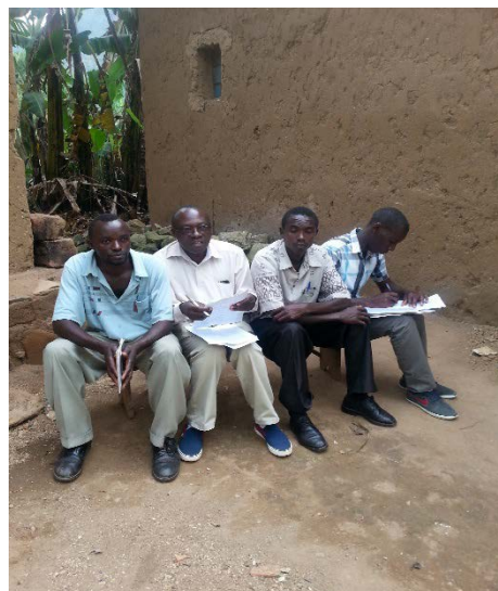
Interview with Engaged Fathers in Karongi district

The framework divides male engagement actions in MIYCN into the following domains, based on demonstrable ways that men may be able to exercise positive influence on MNCH outcomes: (1) Financial and resource support; (2) Sharing workload; (3) Social support and health promotion; (4) Physical support/accompaniment; and (5) Communication with spouse, shared decision-making. Figure 2 presents illustrative actions for the engagement behaviors described in the framework.