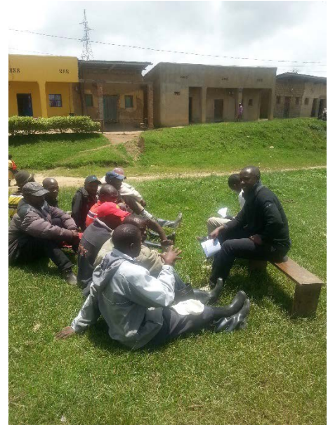
Focus group discussion of males being conducted in Karongi district

Detailed notes from the FGDs and interviews were taken in Kinyarwanda, as participants are most comfortable in this language. The notes were later translated by the note takers into English for analysis. During this translation process, it is likely that some of the finer shades of meaning presented in the local language discussions were lost. Although there were two note-takers per group to mitigate the potential for missed information, there is the possibility that some elements of the responses were not fully captured.